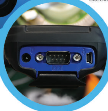
Wi-Fi, Bluetooth, GPRS modem, 5 MP camera, voice call and MMS mini waterproof USB connector, RS232 serial port

STONEX S4 II supports RTCM 2.3 differential correction signals from CORS and GPS networks: in addition to the worldwide correction signals WAAS, EGNOS, GAGAN, MSAS, QZSS the positioning accuracy can be increased up to 1 m.